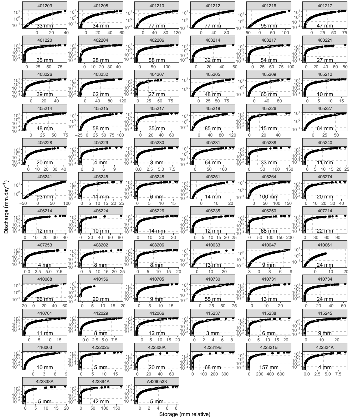
Figure S2. Storage discharge relationships and dynamic catchment storage as estimated using the Kirchner (2009) method. Dynamic storage is presented relative to mean discharge. Australian Water Resources Council station IDs are the title for each plot facet.