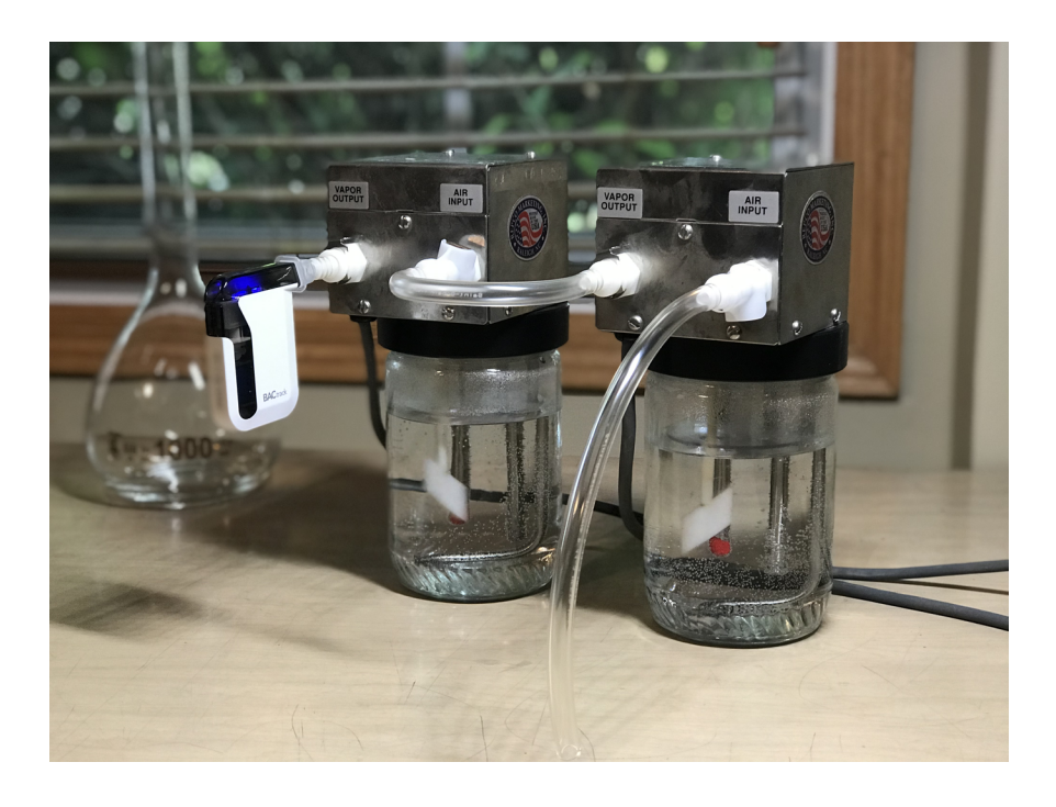
Figure 2: Breath simulator set-up