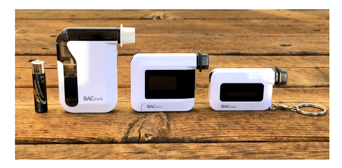
Figure 1: BACtrack (R) Pro, C8, and C6

Before testing, users must abstain from drinking alcohol for a period of at least 15-minutes. This allows for residual alcohol in the mouth from recent drinking to dissipate so as not to falsely elevate the test (19; 20; 21; 22; 23). The instruments do not have a mechanism to monitor for residual mouth alcohol, such as those used in more advanced infrared breath alcohol analyzers (24).