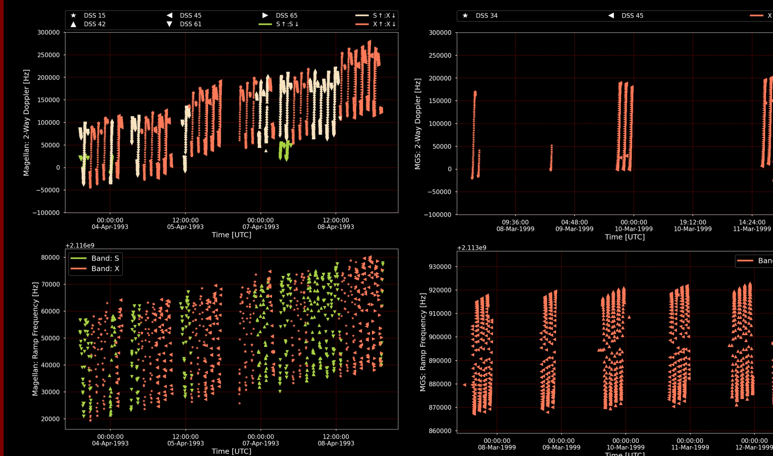
Figure 2 illustrates the example output of the software. For demonstration purposes, we have processed two ATDF files independently. Panels A and B show the recovered Doppler observables and ramp frequencies from the Magellan mission when the spacecraft orbited Venus, while panels C and D correspond to NASA's Mars Global Surveyor mission when the spacecraft orbited Mars.