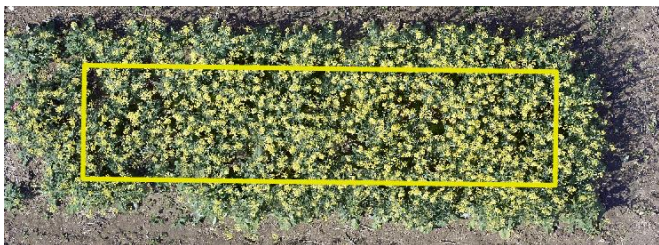
Single canola plot acquired through high resolution RGB-Imagery taken on 12 th of July